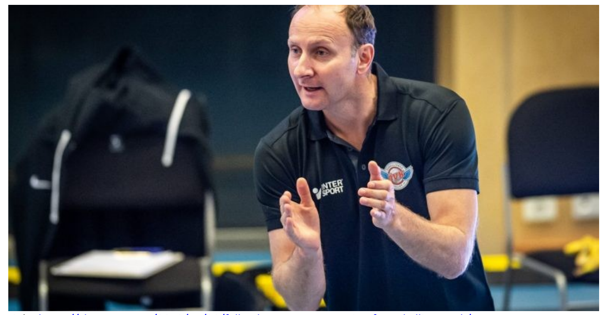
Link - https://skanesport.se/2019/11/30/falkenberg-nasta-utmaning-for-orkelljunga-vk/